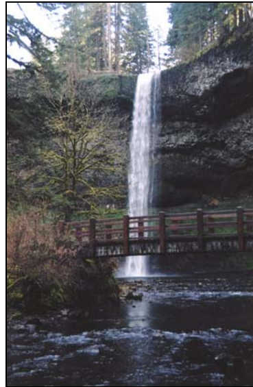
Silver Falls State Park

The Board shapes and upholds the organization's mission, articulates a compelling vision and ensures the congruence between decisions and core values. It establishes policy, hires and supervises the Executive Director, helps secure adequate funding, monitors finances and maintains and updates long-term plans.