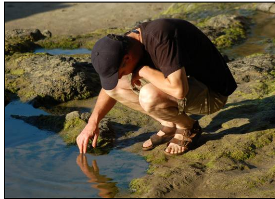
Oregon State Parks Provide Opportunities for Discovery

Reservation, and the Nez Perce Tribe, purchasing a $900,000 partial ownership in the Iwetemlaykin State Heritage Site in northeastern Oregon. The Governor's 2009 Park-a-Year, it now provides visitors with trails, interpretive panels and visitor facilities in a stunningly beautiful and culturally-important setting.