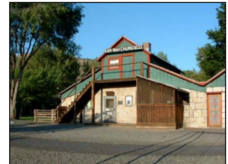
Kam Wah Chung State Heritage Area

Trustees are elected by the Board to serve three-year terms. A Trustee may be re-elected for an indefinite number of terms.