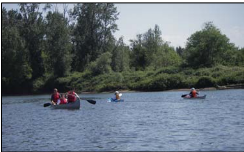
Paddlers on WRWT

Oregon State Parks Trust took part in the final dedication event for the Willamette River Water Trail, held at Willamette Park on Saturday, June 2.