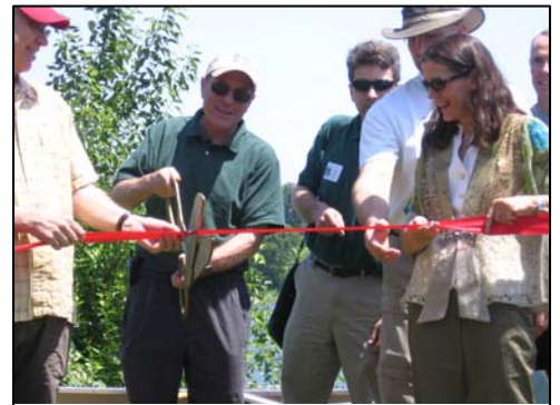
Governor Kulongoski cutting the ribbon on the third phase of the WRWT