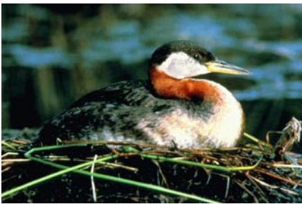
Red-necked Grebe

Our Birdathon started at 6:00pm Friday at Taft Park (just south of Lincoln City), with a beautiful breeding plumage Red-necked Grebe and a rare (but otherwise unremarkable) immature Glaucous Gull and ended 24-hours later at Basket Slough National Wildlife Refuge, as we counted duck species (including an uncommon Blue-winged Teal) until our time ran out. In between, we saw several amazing natural spectacles, such as the young Bald Eagle that flew over Yaquina Head, causing several thousand Common Murres to fly off the rocks for the relative safety of rafting together on the ocean's surface.