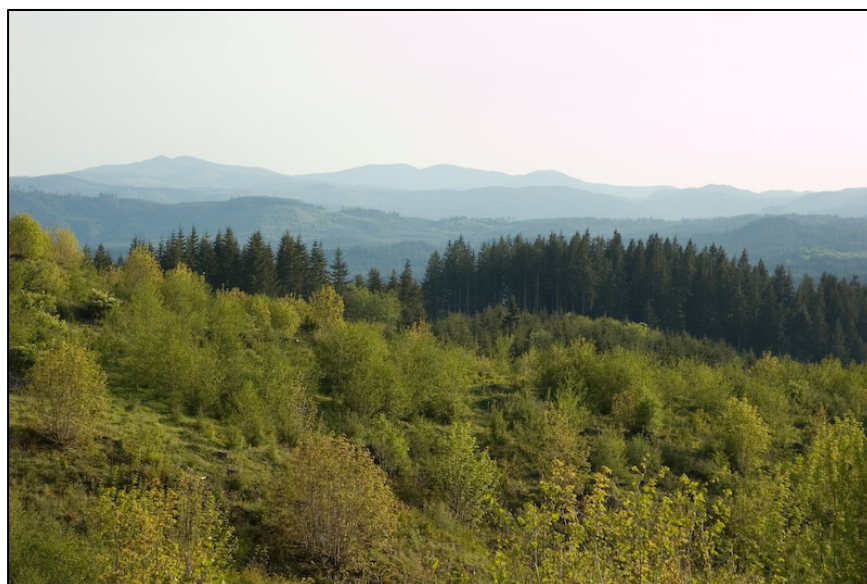
Stub Stewart State Park

State and local officials are ready to celebrate the grand opening of Oregon's first new state park campground in more than 30 years. Stub Stewart State Park, in western Washington County, will officially open on Sunday, July 8, 2007.